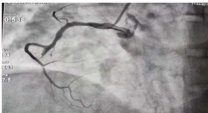
Figure 1. Acute occlusion of the proximal segment of the right artery.