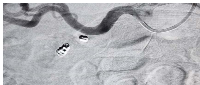
Figure 4C. Complete hemostasis is achieved by closing the GDA.