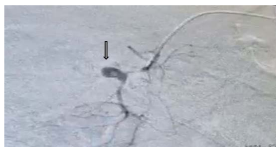
Figure 4B. Angiography showed active bleeding.